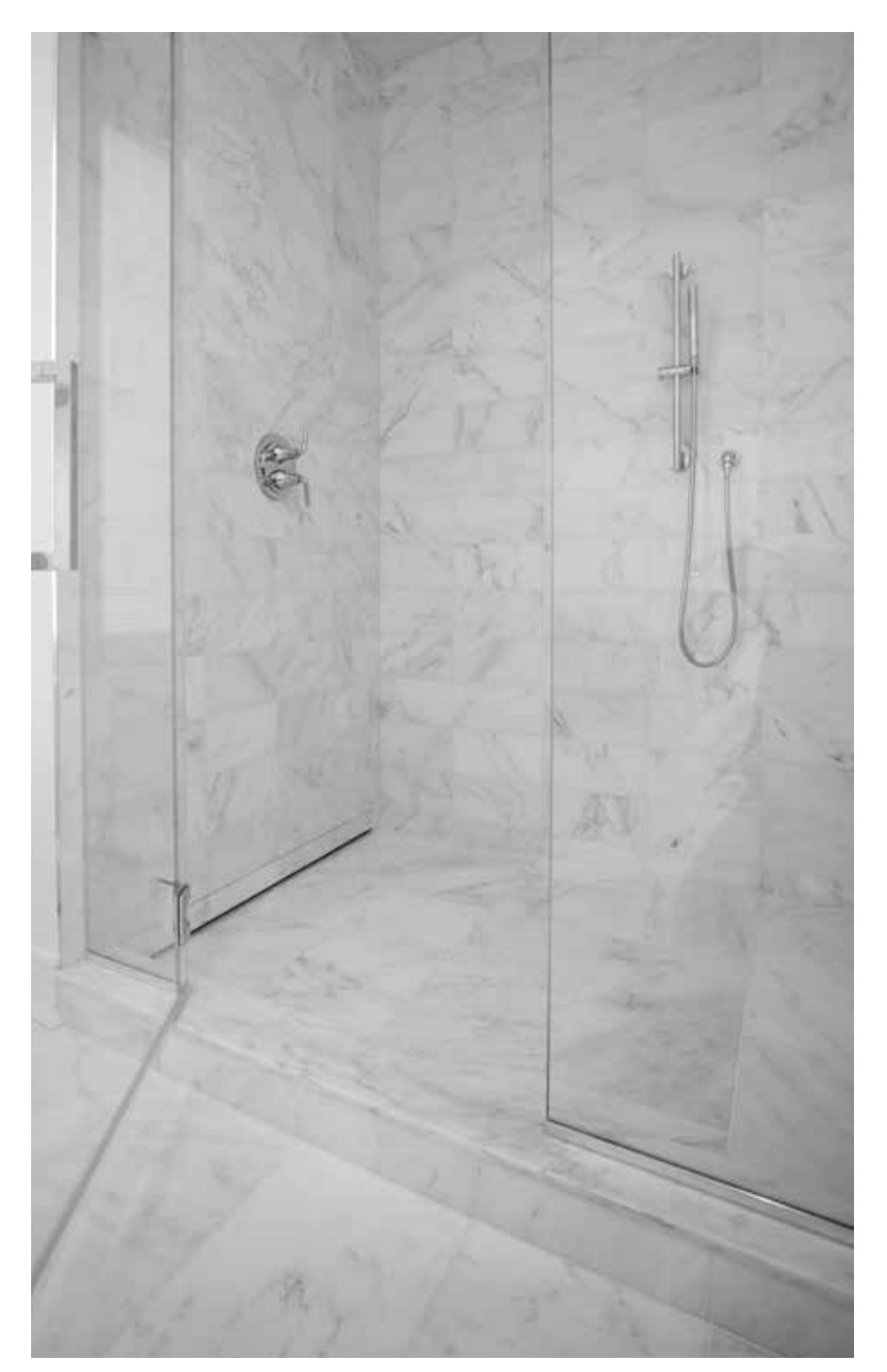
Elegant and exclusive design