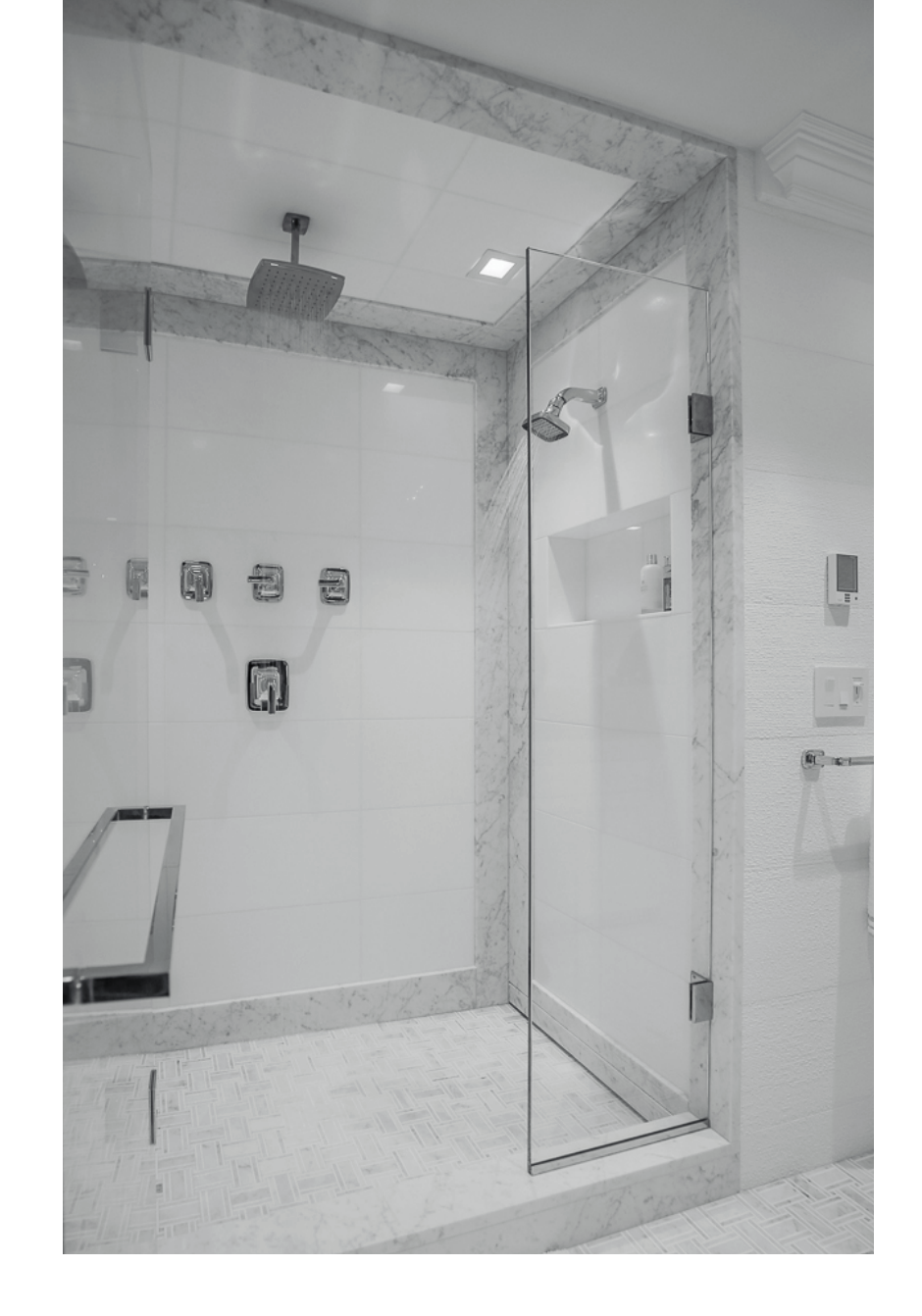
DUW - Flangeless